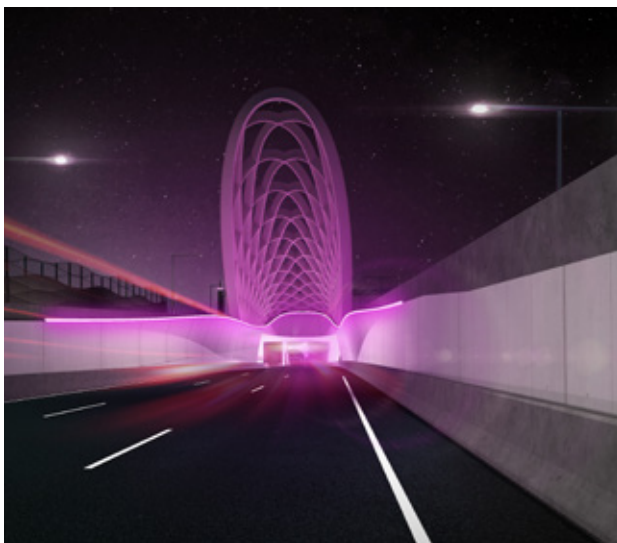
Inbound tunnel portal - night view

Artist impression only - does not include detailed design