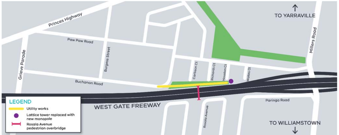
Service investigation and power line relocation works area