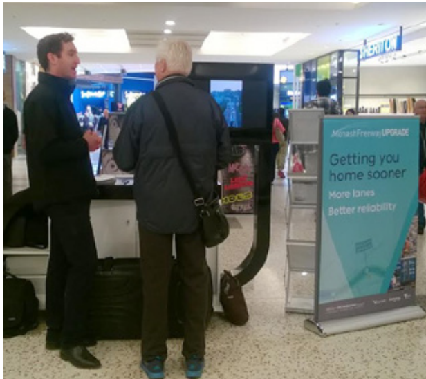
Discussing the project with local residents at Fountain Gate Shopping Centre

The Monash Freeway Upgrade team has been visiting shopping centres in the areas around the freeway to make sure the word is getting out and that you are aware of what we're doing. It's been great to hear your thoughts about the freeway and our project, and to answer your questions.