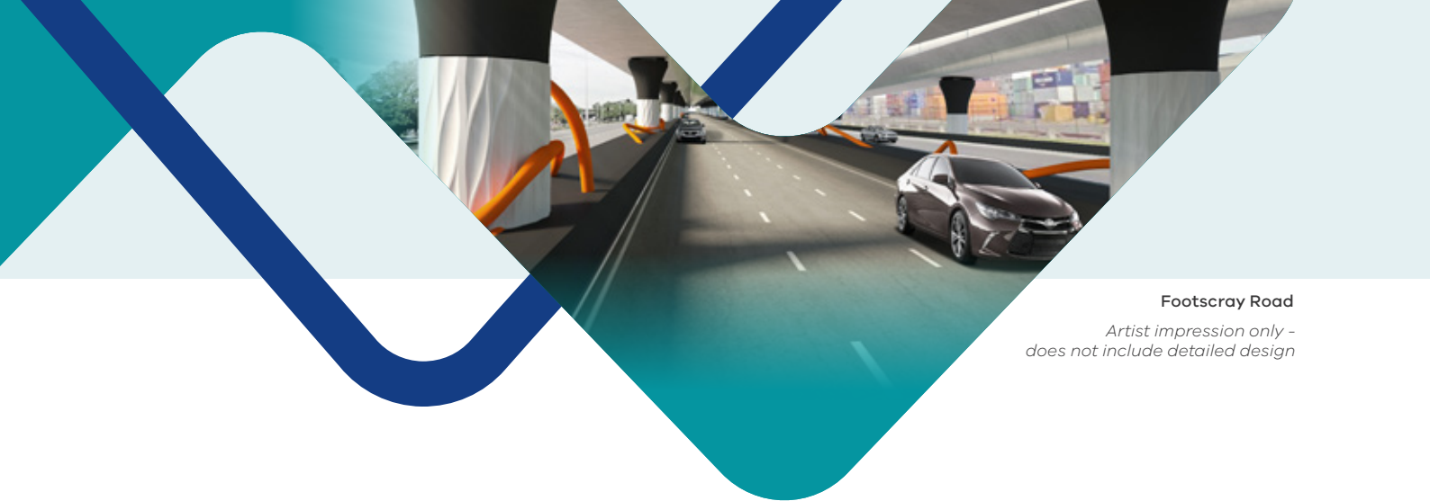
Footscray Road Artist impression only - does not include detailed design