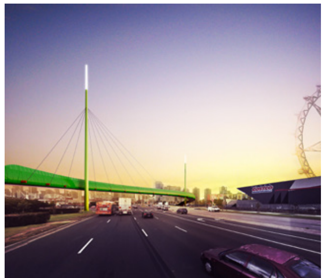
Bridge over Footscray Road Artist impression only - does not include detailed design

If you are deaf, or have a hearing or speech impairment, contact us through the National Relay Service. For more information, visit: www.relayservice.gov.au .