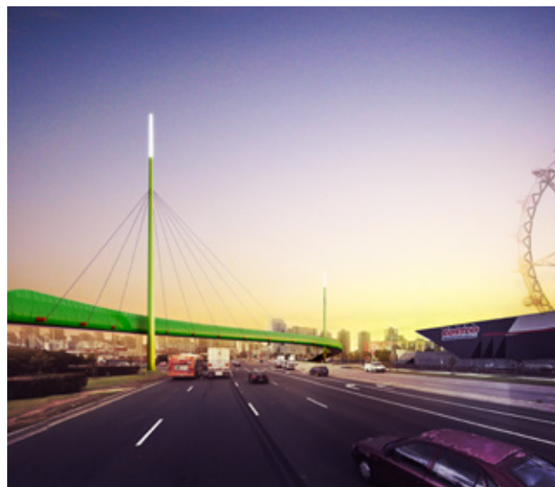
Bridge over Footscray Road Artist impression only - does not include detailed design

If you are deaf, or have a hearing or speech impairment, contact us through the National Relay Service. For more information, visit: www.relayservice.gov.au .