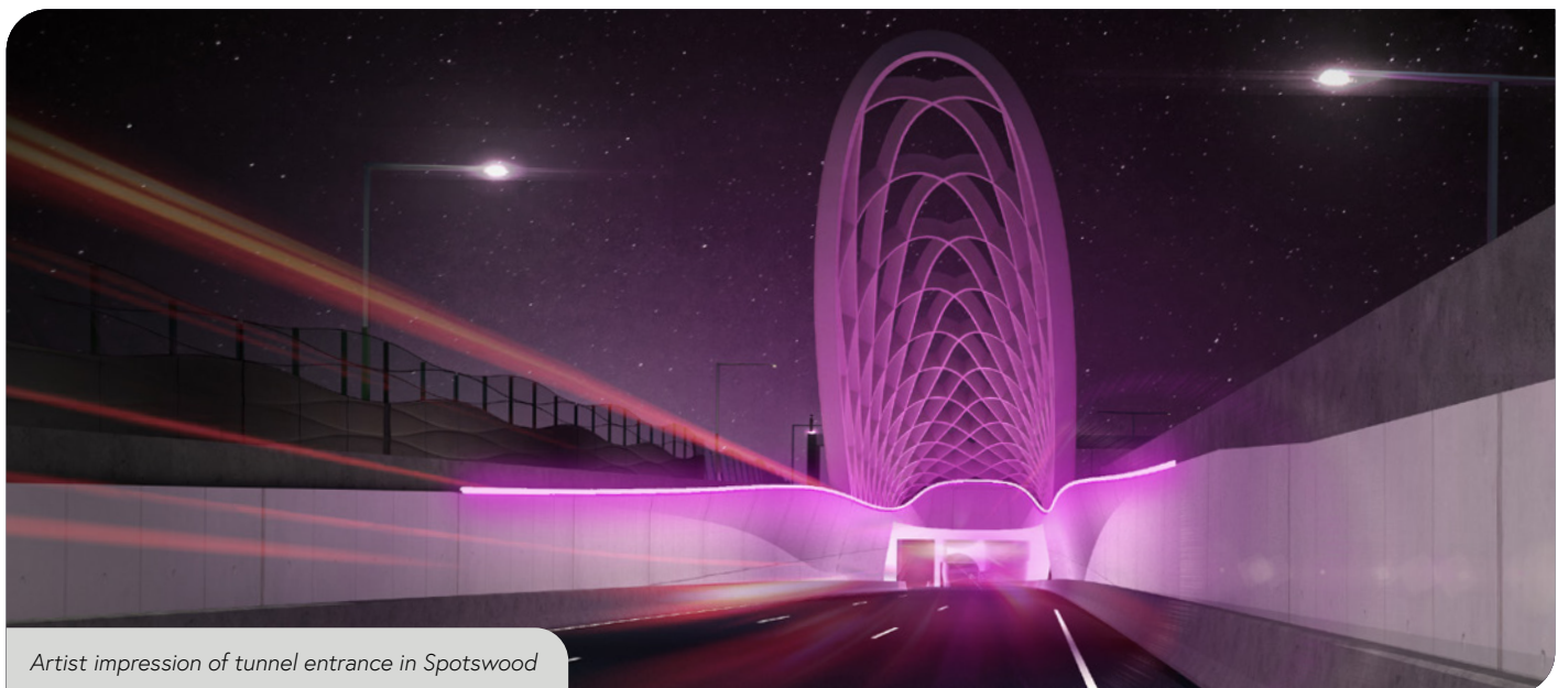
Artist impression of tunnel entrance in Spotswood