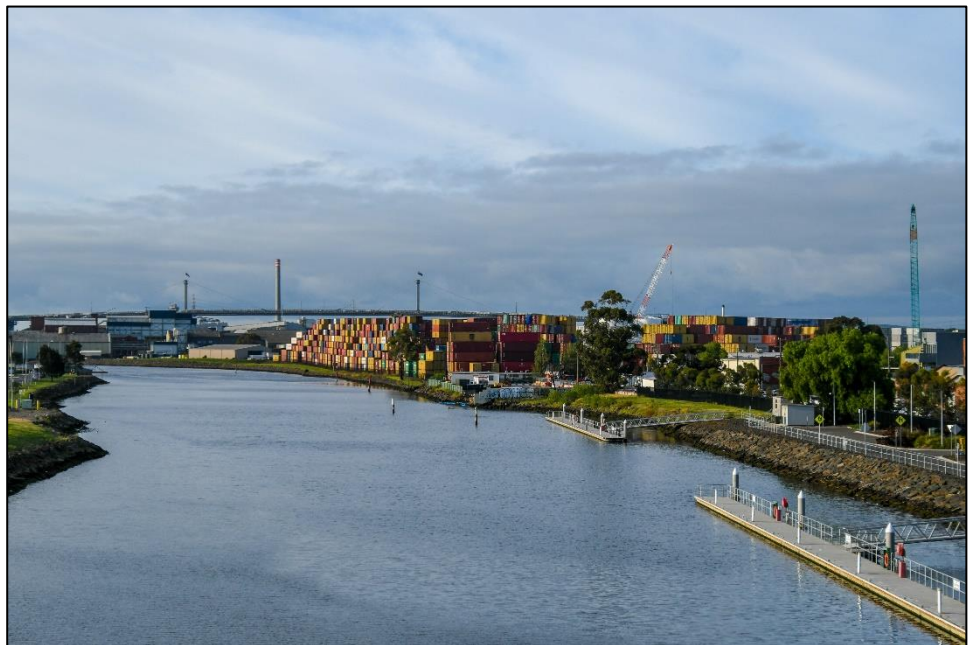
Figure 1 Maribyrnong River

This work will continue until the end of January 2019 as the project gets ready to work along the river bank area along Maribyrnong Street up to Shepherd Bridge. Fencing and barriers will be installed in this area to separate our construction site from the road, and there will be no public access to these areas – shown in orange on the map overleaf.