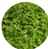
Native River Mint

Please note that the species and images listed are not limited to that shown above and are only a selection from the overall planting palette.