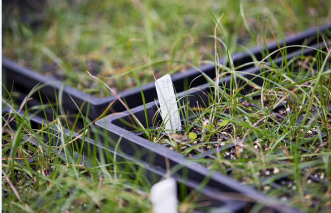
A selection of native grasses, trees, shrubs and ground covers will be planted