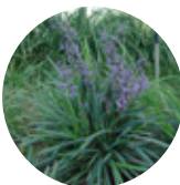
Blue Flax Lily