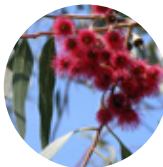
Red Flowering Yellow Gum