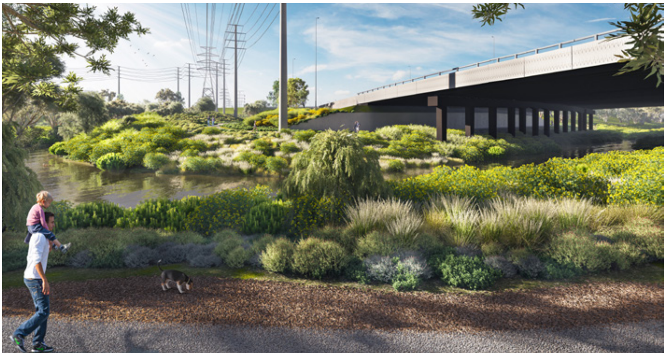
Artist impression of the Kororoit Creek Trail linking to the Federation Trail