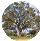
River Red Gum