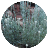
Milky Beauty Heads