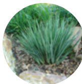
Spreading Flax Lily