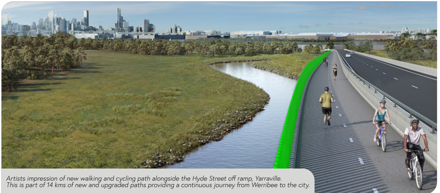
Artists impression of new walking and cycling path alongside the Hyde Street off ramp, Yarraville. This is part of 14 kms of new and upgraded paths providing a continuous journey from Werribee to the city.